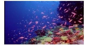
Great Barrier Reef, vibrant and full of life, 1985