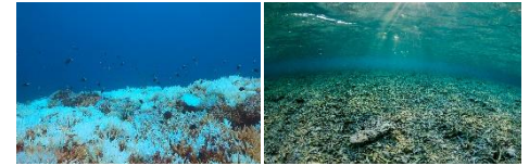
Dead bleached coral Total reef destruction