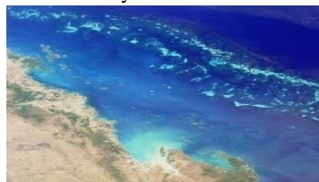
Great Barrier Reef from space, The only living structure visible from space

More than 50% of the coral on the Great Barrier Reef in Australia has recently died. When ocean temperatures increase, the coral polyps eject their symbiotic algae, which produce food for the polyps, and eventually die.