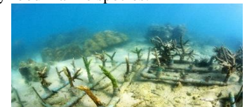
Planting coral on an artificial reef

Dr. Van Oppen collects the spawning eggs and sperm and is trying to create corals, that are tolerant of higher water temperatures, by three methods: 1) Cross-breeding to create hybrids. They are also maintaining corals at gradually higher temperatures to see if they adapt. 2) Manipulating the microbiome of corals to determine if they will become heat resistant by gradually increasing water temperature and by the CRISPR-Cas9 gene editing tool. 3) Adapting the symbiotic algae, that live in the coral polyps and produces the polyp’s food, to higher temperatures and by gene editing. If the research is successful, scientists hope to re-seed the baron reefs with heat-tolerant corals which will hopefully restore this productive and beautiful habitat. Coral reefs are the nurseries for many food marine species.