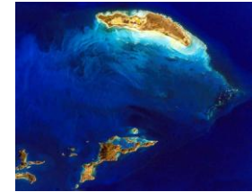
Satellite image: Anegada top, Virgin Gorda bottom