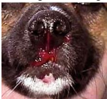
Ehrlichia - induced epistaxis